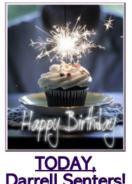
TODAY, Darrell Senters!

Ladies, if you were in charge of a Hearts in Harmony ministry in 2024, please complete the evaluation form in your binder and return your binder to the office as soon as possible.